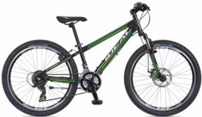
STROBE 24 disc