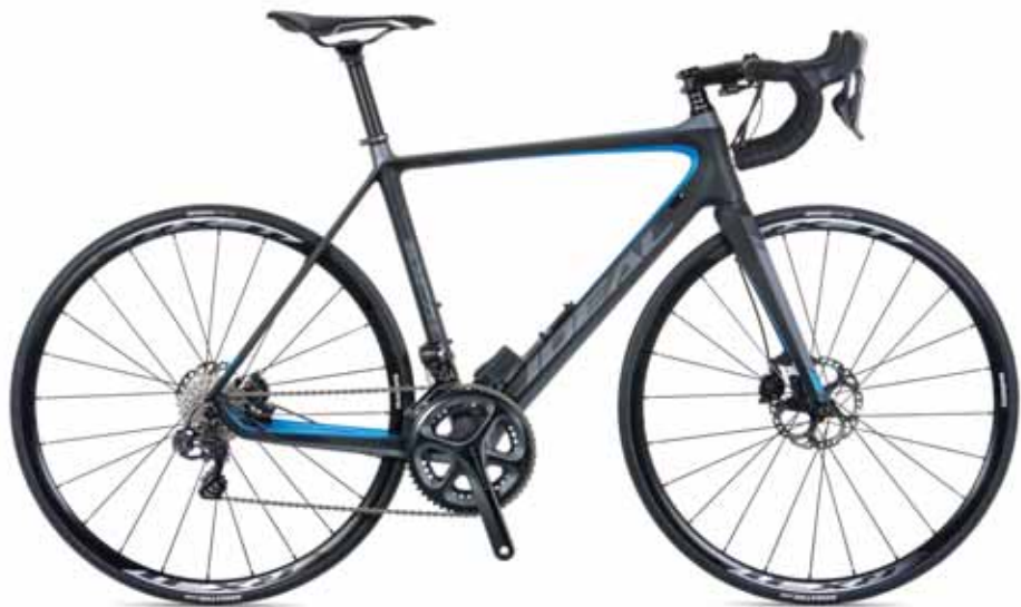
STAGE team Disc Di2