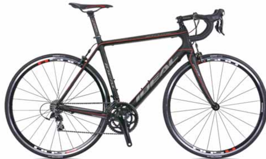
STAGE comp 105

Color: Satin UD Carbon/Satin Anthracite/Blue